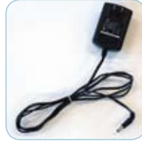
Power Adapter (AC 110-240V)