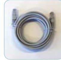
One Ethernet Cable (RJ-45)